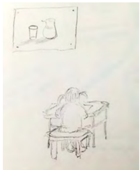
Figure 1: From a student journal.

These principles informed the choice of data collection methods. The teachers were asked to create participatory art journals within which they could reflect on and record their beliefs and values surrounding the visual arts. They were prompted to consider their own past experiences with the visual arts as well as how their beliefs around teaching had evolved and had influenced their ideas about the role of visual art in children's learning. This data could be recorded through self-made images, found images or textual entries. At the end of the data collection period, in which classroom observations, four interviews with children and evidence of children's visual art making had also been collected, all of the teachers participated