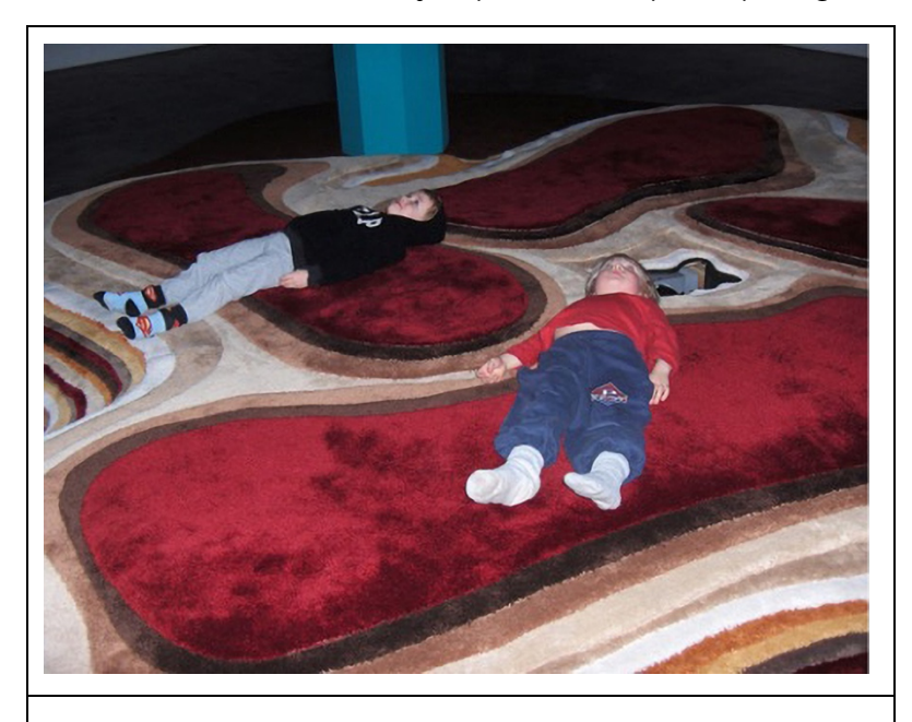
Figure 3. 'Wow, this is like dreaming!'

Taking children to the arts implies encounters with visual arts in an art museum or a public space. In the following example, two five-year-olds were visiting an art museum and the exhibition by the Swiss artist Pippilotti Rist, which was a dynamic combination of three-dimensional objects and visual projections. The artwork entitled Gravity, be my friend 2 attracted the children's attention to the extent that they spent a lot of time with it. In the piece the artist had built an island of carpets on which a projector was placed. The visitor was invited to lie down on the island and look up at the roof on which a film was projected (Figure 3). Lying on the island, Adnan, one of the children, sighed deeply, laughed and said: 'Wow, this is like dreaming!' His peer, Tim, nodded and laughed while leaning back on the soft carpets. The two children were totally focused on the artwork and the visual and sensory experience of participating in this event.