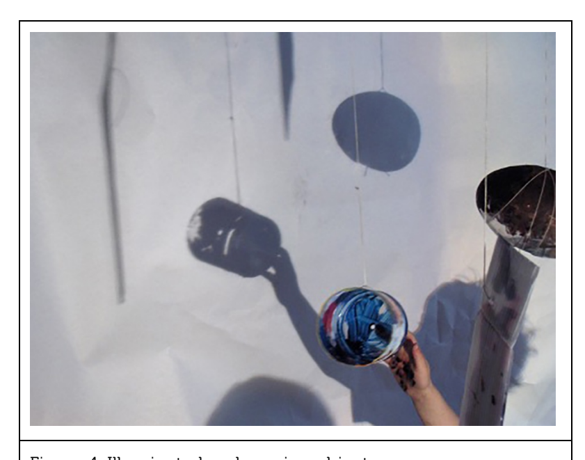
Figure 4. Illuminated and moving objects

Back in the preschool atelier, the two children showed photographs and described their experiences of visiting the exhibition. One of the crucial things for the two children was the concept of an exhibition, so they suggested constructing an exhibition and inviting peers and guardians to it. This suggestion led to the first aesthetic event after the visit to the art museum. The two children and the invited peers painted transparent objects with acrylic paint, which were later hung from the ceiling and illuminated. When the exhibition was to be shown, two essential ingredients were to illuminate the created objects and make them move so that their shadows rotated (Figure 4). The museum visit remained an active memory for the children for at least eight months. The children who had not been to the exhibition talked about it, wanted to continue working with inspiration from it and retold visual events from the exhibition as though they had been there.