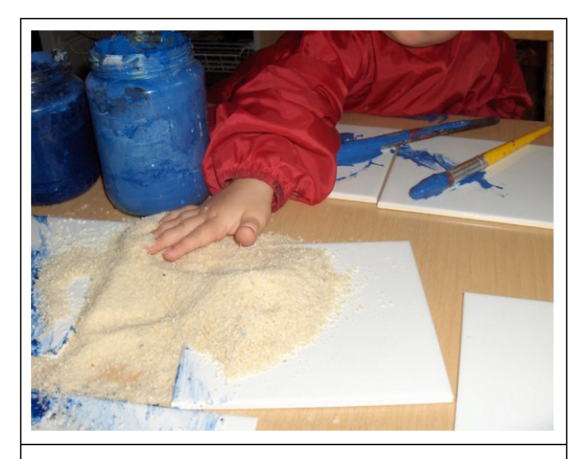
Figure 1. Sara and the breadcrumbs